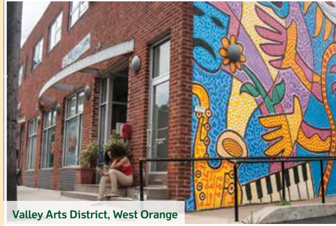
Valley Arts District, West Orange