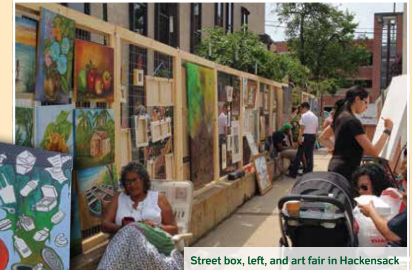
Street box, left, and art fair in Hackensack