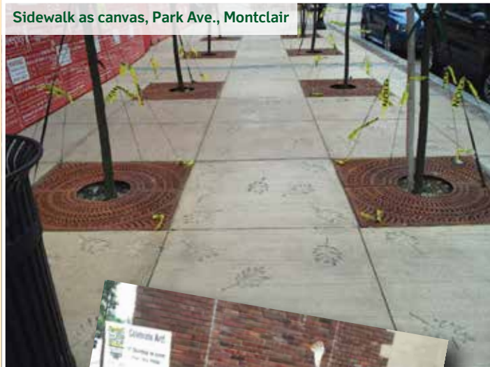
Sidewalk as canvas, Park Ave., Montclair

CREATIVE PLACEMAKING IS BEING EMBRACED nationwide as a promising approach to revitalizing public spaces. It uses the arts to bolster civic pride, improve the quality of life for residents and create a climate for economic development.