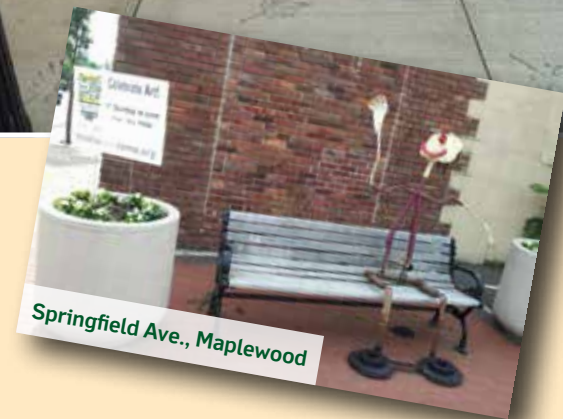
Springfield Ave., Maplewood