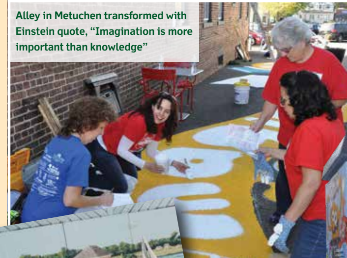
Alley in Metuchen transformed with Einstein quote, "Imagination is more important than knowledge"