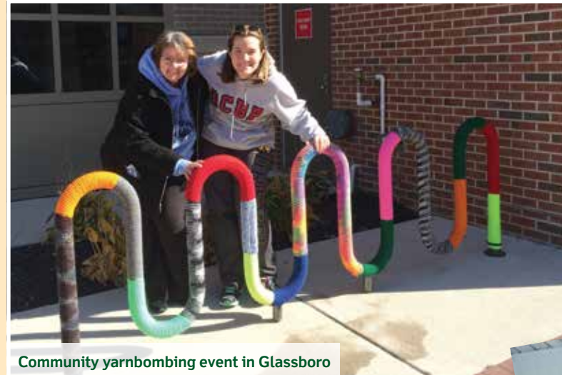
Community yarnbombing event in Glassboro