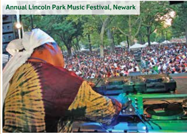
Annual Lincoln Park Music Festival, Newark